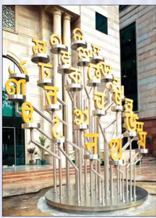
Alphabet Tree in 3D form