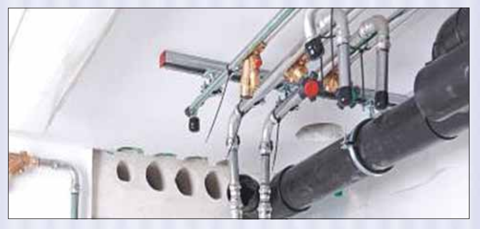
The utmost care was taken in preparing for the assembly in the Antarctic: Openings for the drinking water installation realised with the Viega "Sanpress Inox" system made of stainless steel 1.4521.