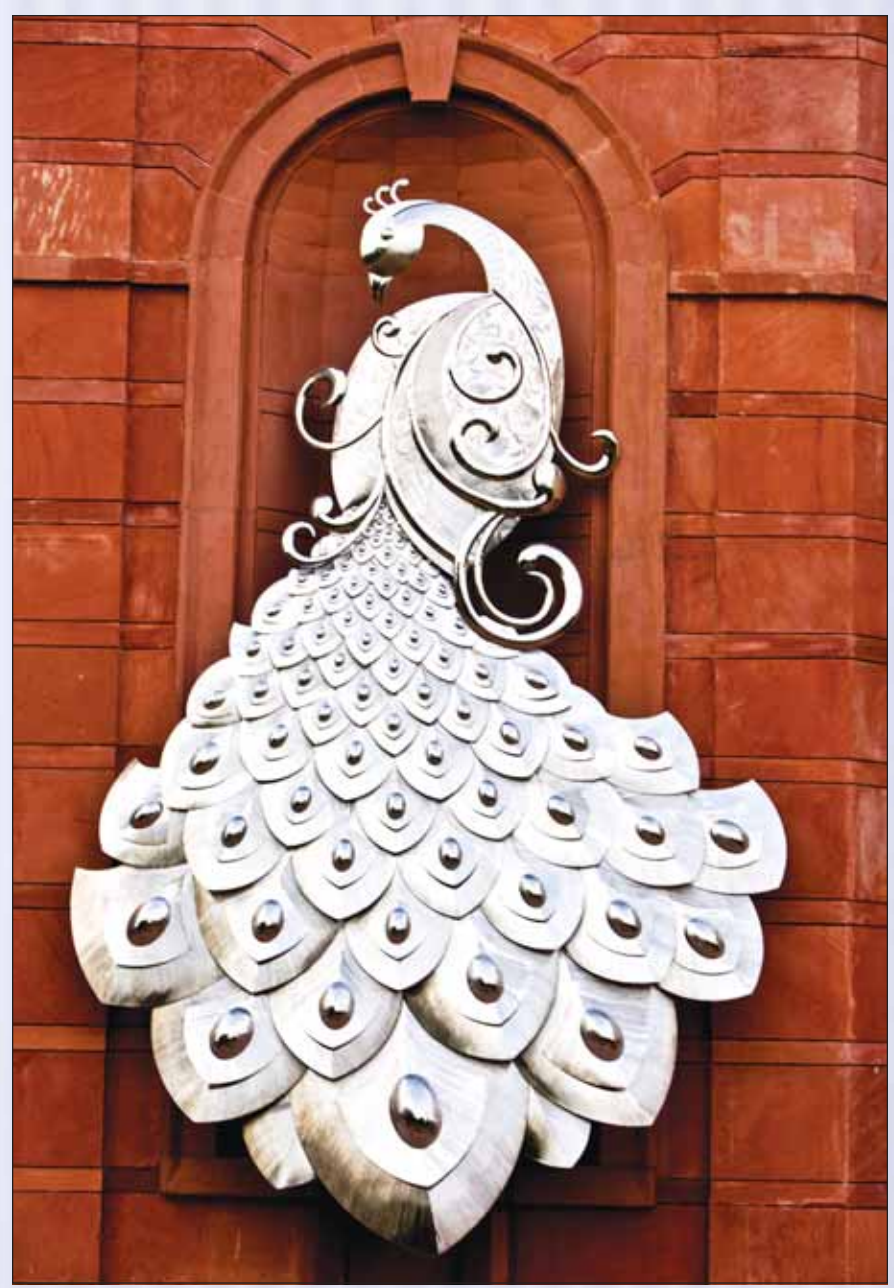
The Niche Peacock in Stainless Steel AISI 316