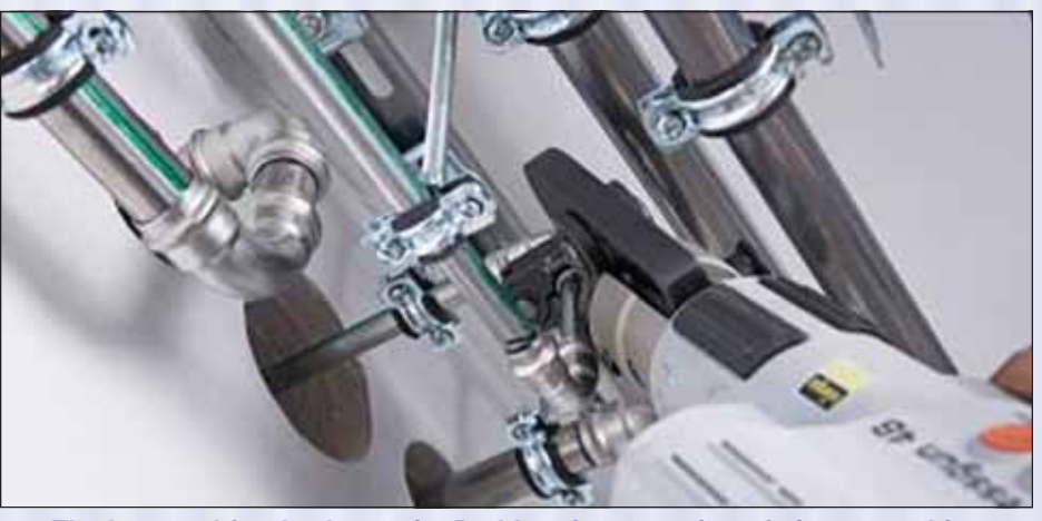
The best tool for the Antarctic: Problem-free pressing of pipes at ambient temperatures around freezing and in the tightest of spaces – with the help of press rings.

drinking water and heating installations, pre-wall and drainage facilities, gas, solar and compressed-air installations for buildings, industrial plants and shipbuilding.