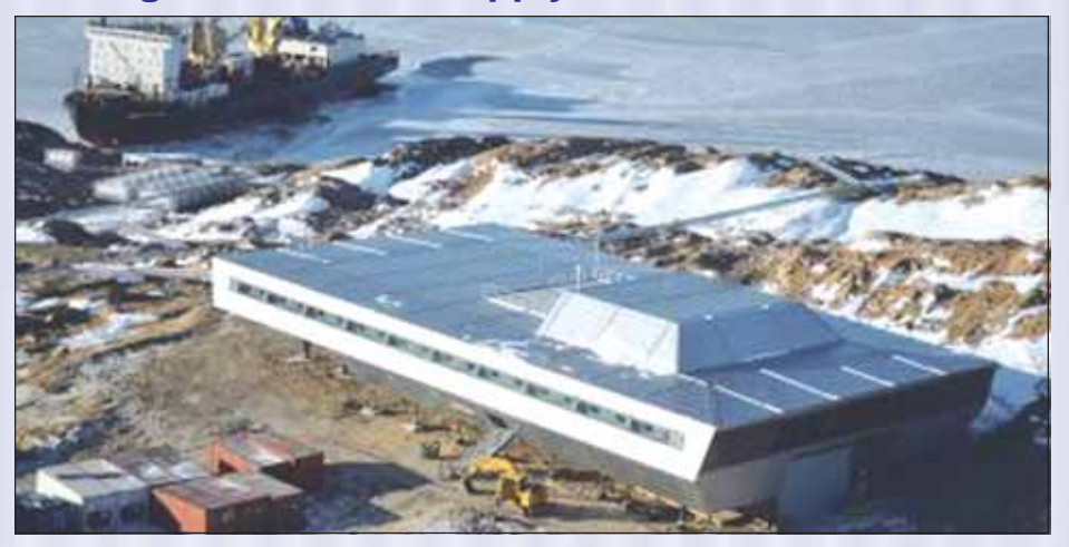
In March 2012, the new Indian "Bharati" research station was officially commissioned at the Larsemann Hills on the eastern Antarctic coast.

Viega is one of the leading companies in the field of plumbing and heating systems. Viega offers their expert solution in all fields of building services: