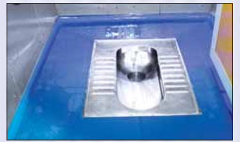
FRP Platform with SS Closet