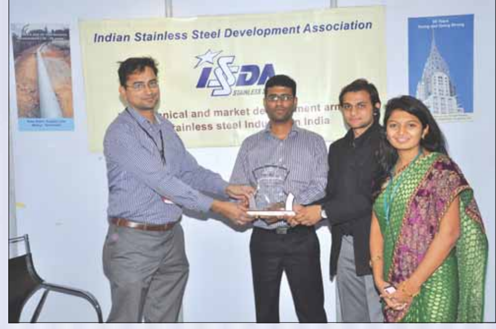
ISSDA receiving the Memento from Kevin Infomedia

Special issue of A+D magazine which showcased the new and innovative applications of use of stainless steel in the Architecture Building and Construction sector were distributed to architects and interior designers visiting our stall. They were also encouraged to visit ISSDA's website <u>www.stainlessindia.org</u> and browse through Supply Chain link to source various stainless steel products and services, including fabricators / contractors.