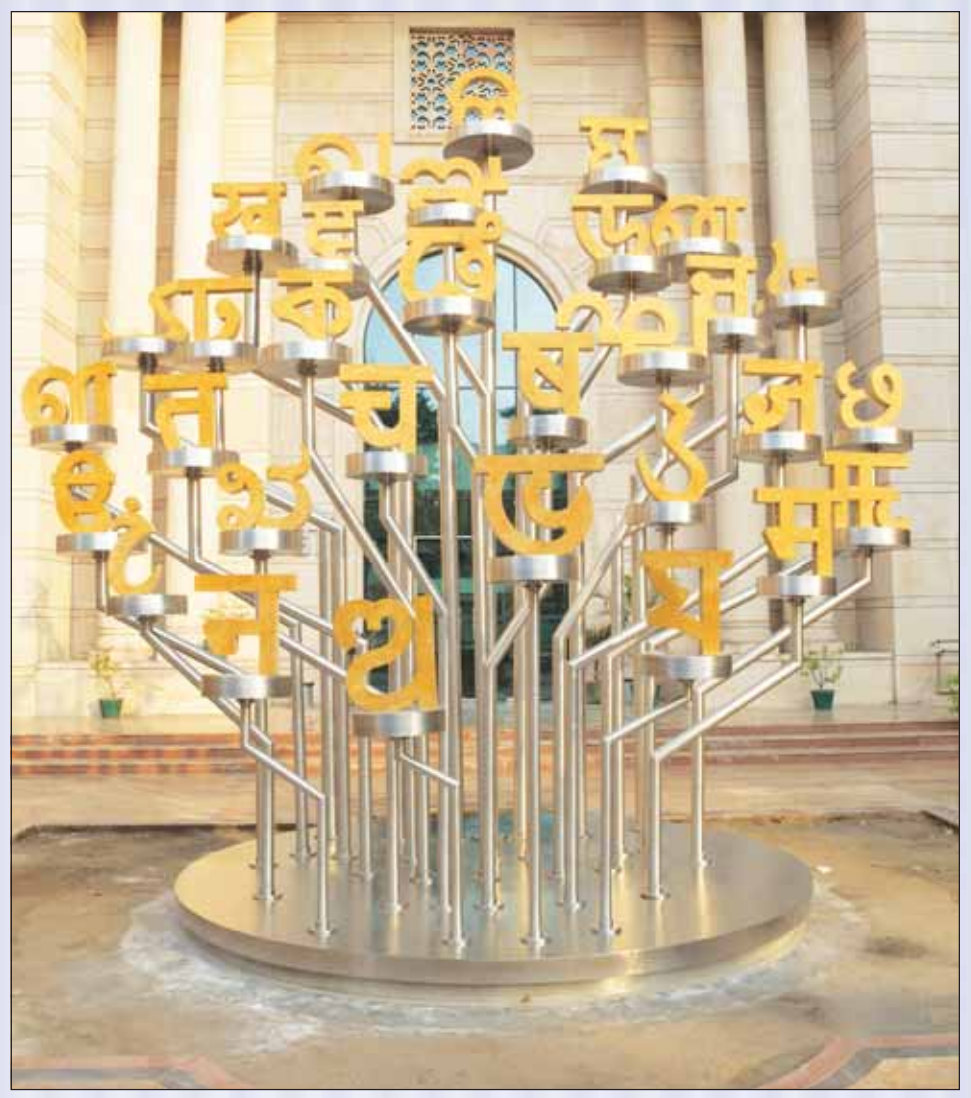
Alphabet Tree in Stainless Steel AISI 316 & 304

According to Ms Baid, "Materials have their own mind. The more we explore them, more they will surprise. A stainless steel peacock just reminds us that perhaps there is a softer side of stainless steel as a material that has not been explored enough yet. Whereas, Alphabet Tree, we